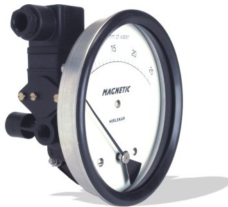
Gauge with switch

OEMs can order instruments with their logo on dial.